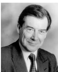
The Rt. Hon. Lord Lang of Monkton, DL Executive Committee Compensation Committee Directors and Governance Committee